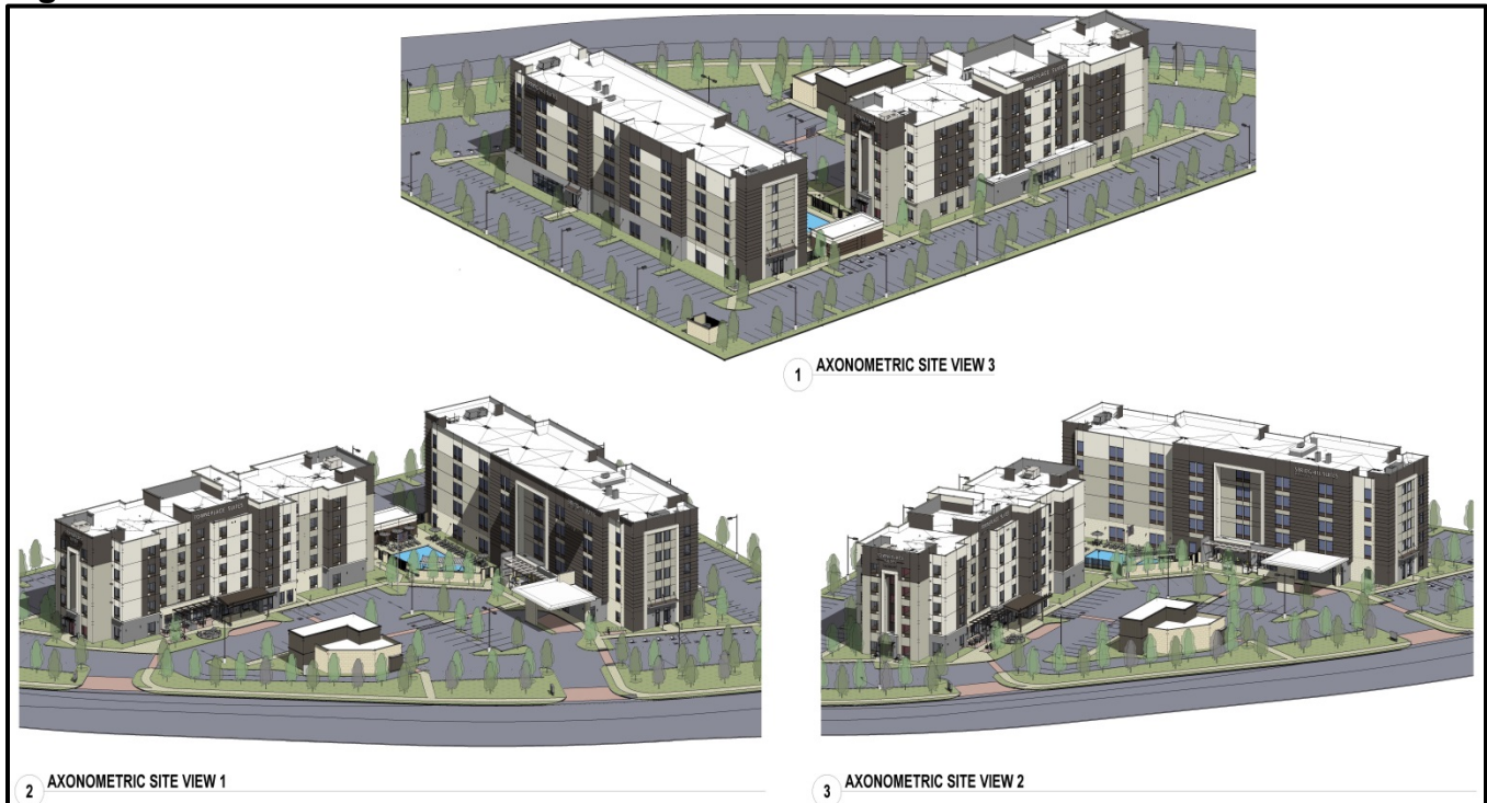
Figure 3: View simulations

The architectural design for the proposed hotel buildings and accessory buildings would be contemporary in nature, and would incorporate high quality exterior finishes including two types of brick (smooth and rough finishes), smooth stucco (painted various colors), and anodized aluminum cladding. The design is typified by simplistic rectangular horizontal and vertical forms, clean lines, and flat roof elements. The massing of the two buildings would be broken up by material and color changes, wall plane articulation (wide bays and recessed elements), and score lines. Building colors would include a range of light tan, grays and dark browns, while the brick colors range from light tan to gray. Figure 3 depicts view simulations of the project from three angles while Figure 4 provides the proposed color and materials palette. A materials board will be provided at the June 27 meeting to better illustrate actual materials and colors.