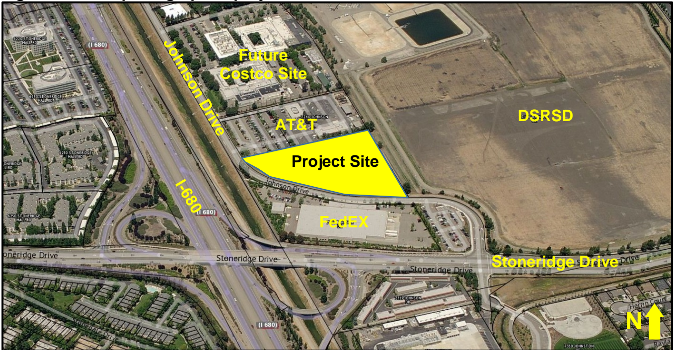
Figure 1: Aerial photograph of project site

The project site is located at 7280 Johnson Drive and comprises two parcels (one of which does not have a separate address totaling approximately 5.06 acres. Both parcels combined are vacant, and relatively flat, and combine to form a roughly triangular shaped site, fronting on Johnson Drive. There are no existing trees on-site. Figures 1 provides an aerial photograph of the subject site. The immediately adjacent uses include an AT&T service facility immediately adjacent to the north, a FedEx distribution facility across Johnson Drive to the south, and the Dublin/San Ramon Services District (DSRSD) bio-solid facility immediately adjacent to the east.