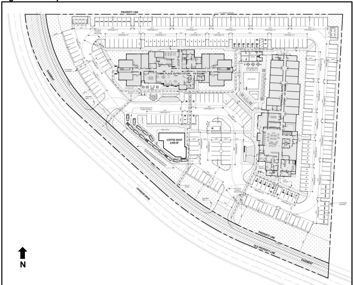
Figure 2: Site plan

Three detached accessory buildings would be constructed on the project site, including a generator/storage/restroom building between the two proposed hotel buildings and adjacent to the swimming pool area, a trash enclosure at the northwest corner of the site, and a trash enclosure at the northeast corner of the site. No fencing is currently proposed.