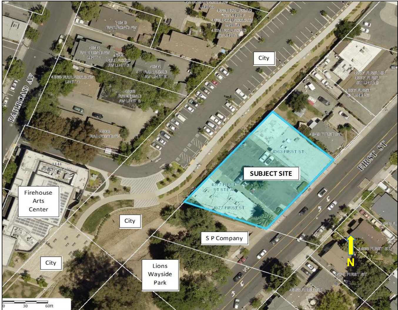
Figure 1: Aerial Photograph of the Subject Site and Surrounding Area