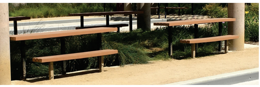
bar table and bench