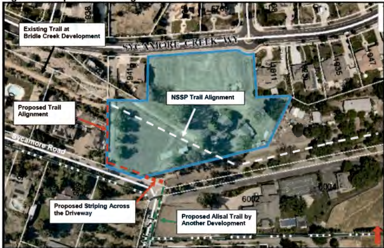
Figure 3: Proposed Trail Alignment and Connections