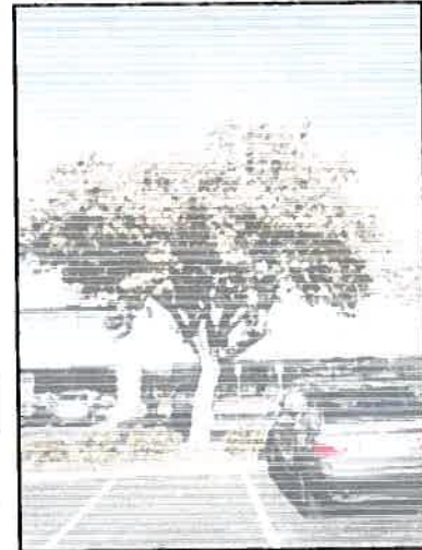
Photo 3: Brazilian peppers had been planted in parking lot islands.

Thirty-two (32) sweetgums were assessed. They were in good (21 trees) to fair (11 trees) condition with no trees in poor condition. Sweetgums were young to semi-mature, ranging from 6 to 17" in diameter with an average diameter of 10".