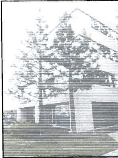
Photo 2: Coast redwoods on site tended to have thin canopies and be pruned up to 15 feet.