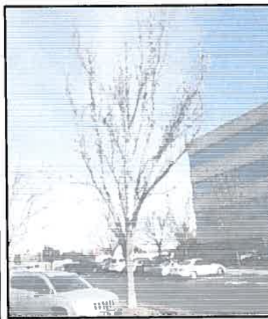
Photo 5: Gallery pear demonstrating epicormic growth and multiple attachments at six feet.