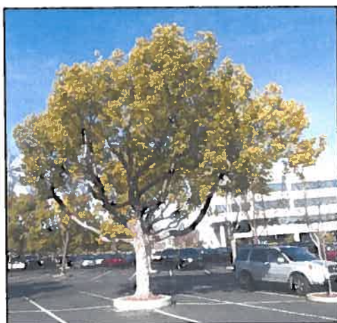
Photo 4: Camphors typically had spreading crowns but had been planted in small parking lot islands.

Thirty (30) European white birches were present on the site. The birches were primarily in fair condition (22 trees), with 7 in good condition and one (1) in poor. They were generally young, ranging in from 6 to 13" in diameter with an average of 9". Many of the birches were leaning, crowded and suffering from twig dieback, indicative of drought stress (Photo 6, following page).