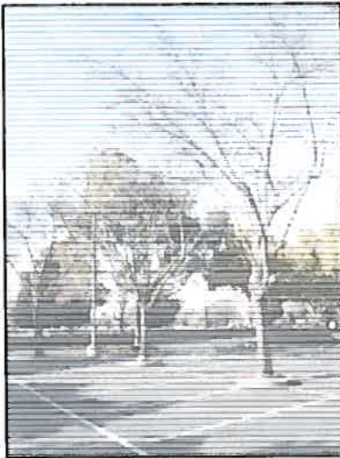
Photo 1: Raywood ashes demonstrating multiple attachment form and small island growing space typical of this site.