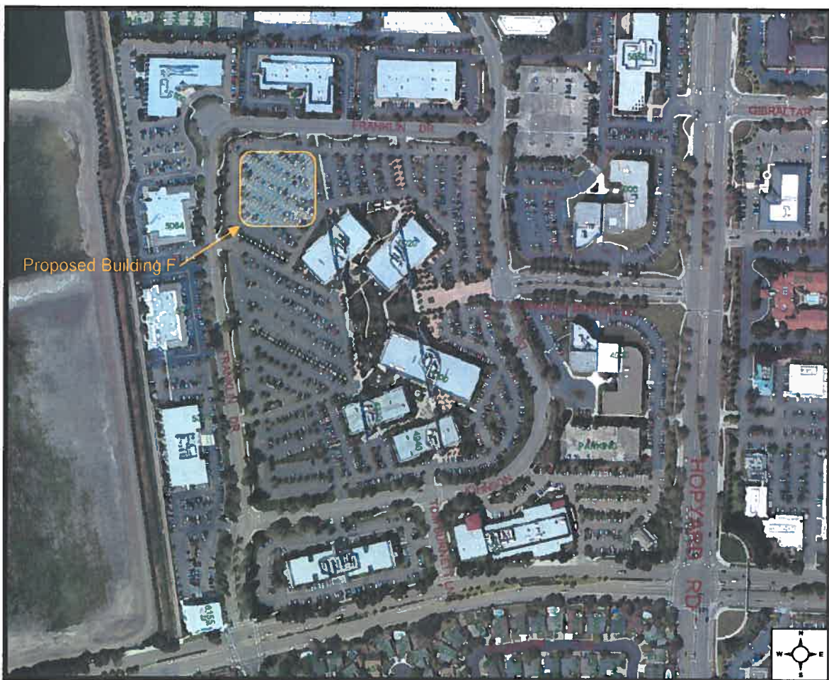
Figure 1, Location Map and Aerial Photograph

The proposed project will be constructed on developed property located in the former 26.15-acre Washington Mutual development defined by Franklin Drive and Johnson Drive. The Washington Mutual Development is part of the former Signature Center Business Park located on the northwest corner of Hopyard Road and Stoneridge Drive. Figure 1, below, is the location map/aerial photograph showing the business park.