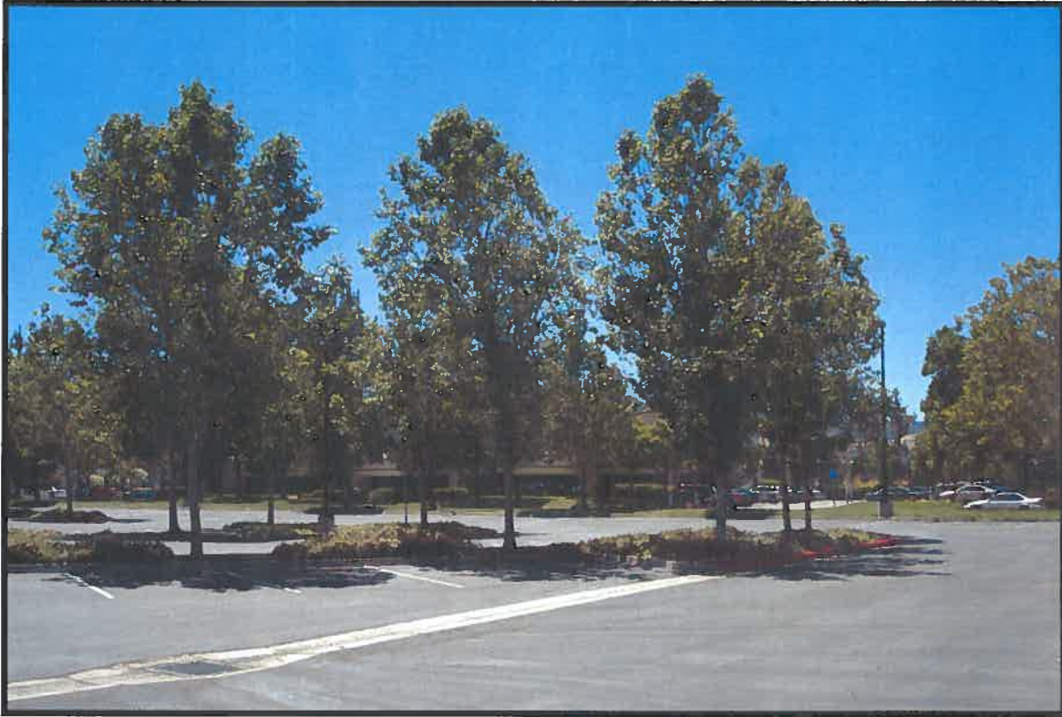
Figure 3, Westerly View of Project Site with Franklin Drive in Background.