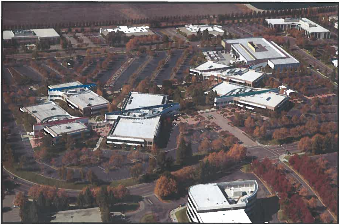
Figure 7, Aerial Photograph/Rendering of the Project Site and Proposal.

Figure 7, below, is the aerial photograph of the existing five-building campus with the proposed building.