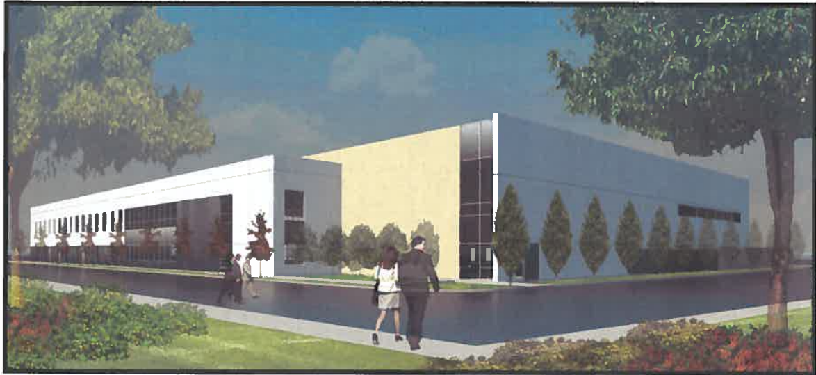
Figure 6, Building Perspective from Franklin Drives.

Figure 7, below, is the aerial photograph of the existing five-building campus with the proposed building.