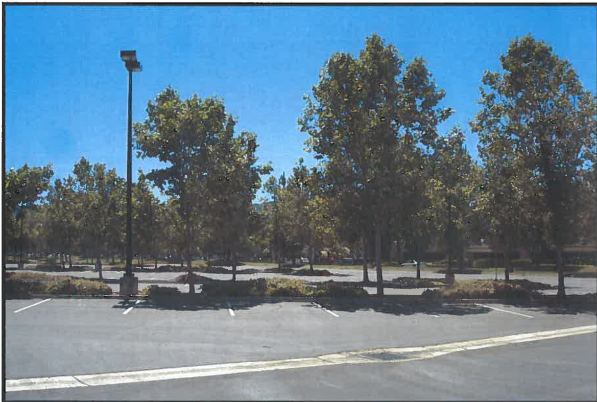
Figure 4, Southwest View of Project Site with Franklin Drive in Background.